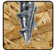
Strip-Loc thread to point technology grips the fiber of OSB